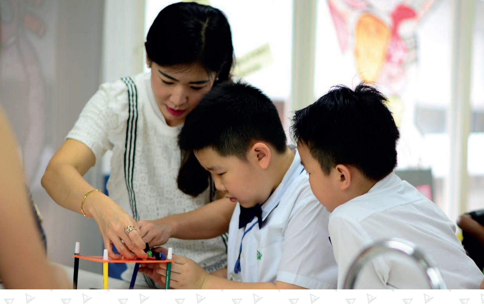
EEP Performance Week